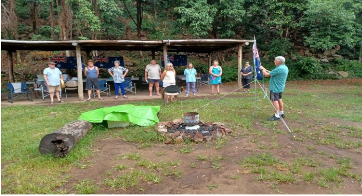
Kookaburras raising the flag on Australia Day