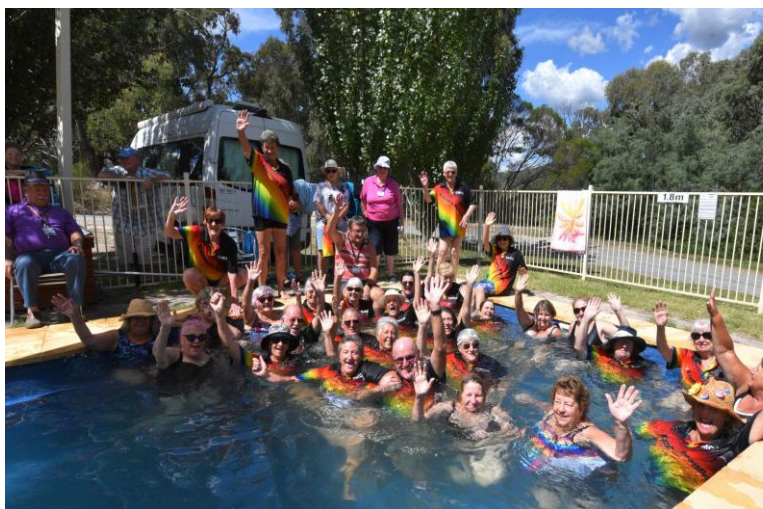
Lima South pool, full of Rosellas