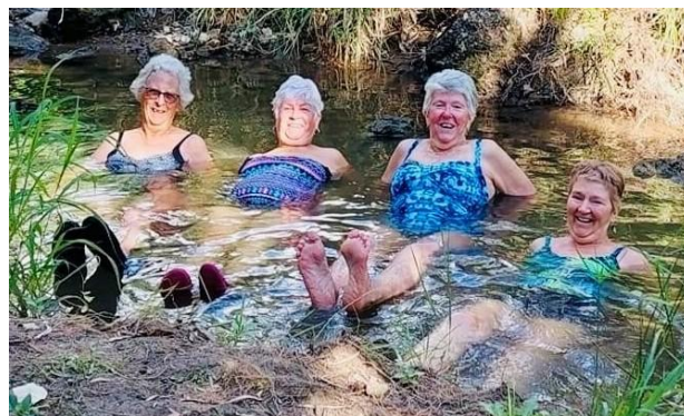
Lorikeet Bathing Belles