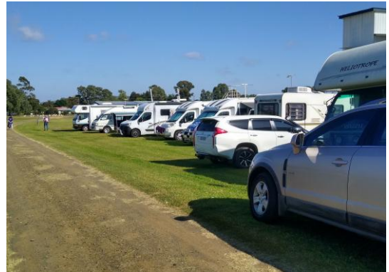
Our motorhomes at Clifton