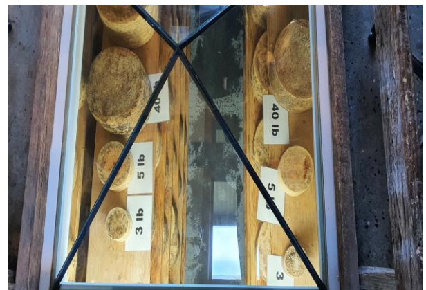
Cheese wheels at Pyengana