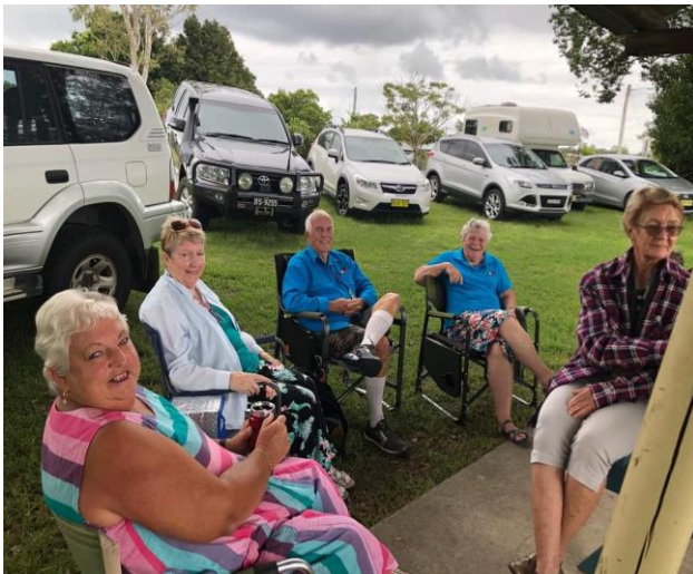
Morning tea at Lawrence

The March Chapter meeting was to be held in Tyalgum but due to severe flooding and inaccessible roads the meeting was shifted to Brooms Head. It was a great time as the sun shone while we were there but it did not last long. Members within the Robins family have and continue to be affected by the floods and our thoughts and prayers are with them.