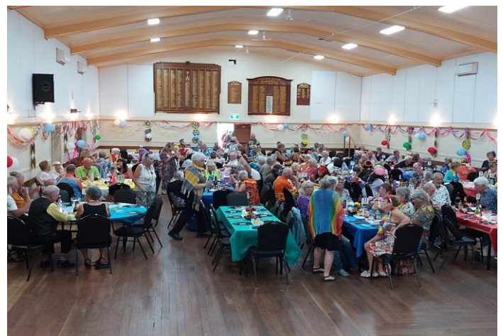
Flower Power Dinner Dance, Cohuna Rally