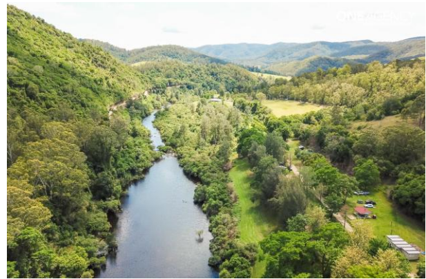
Knorrit Flat Campground