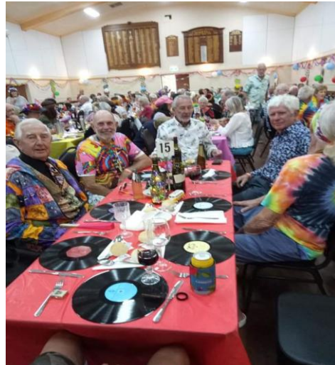
Rockin' Robins enjoying Cohuna Dinner Dance