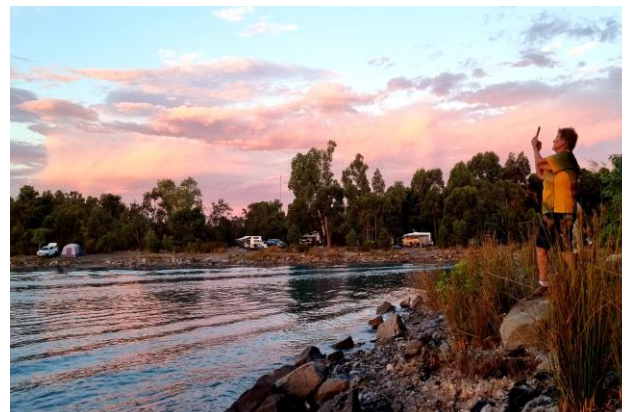
Stockton Lake, Collie