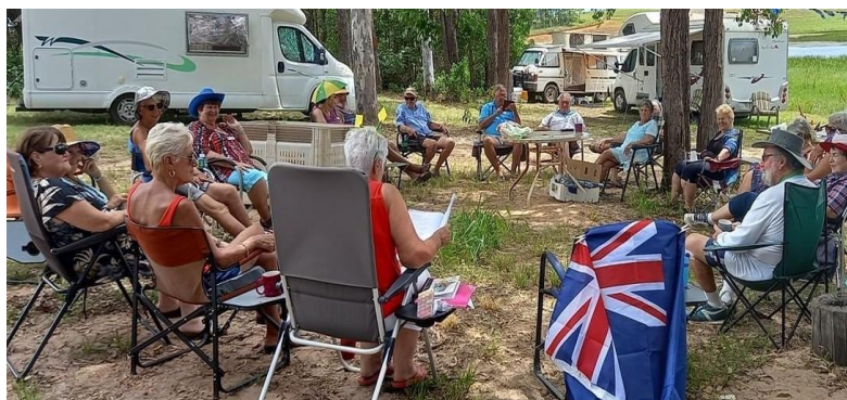
Australia Day at Kingfisher's Nest