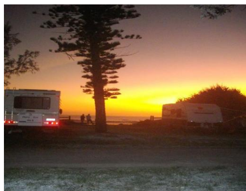
Beautiful sunrise at Broome's Head