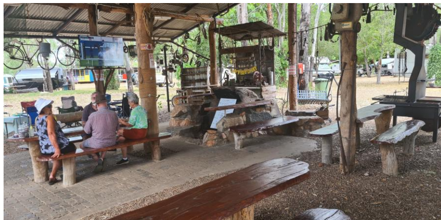
Beautiful gathering area at Bivouac

EDITORS NOTE: Is that Gordon Simons standing inside a table? Great happy hour trick! Had to look very closely to see that it is a bucket on the table, not Gordon's lovely blue shorts. Then it all made sense 😊