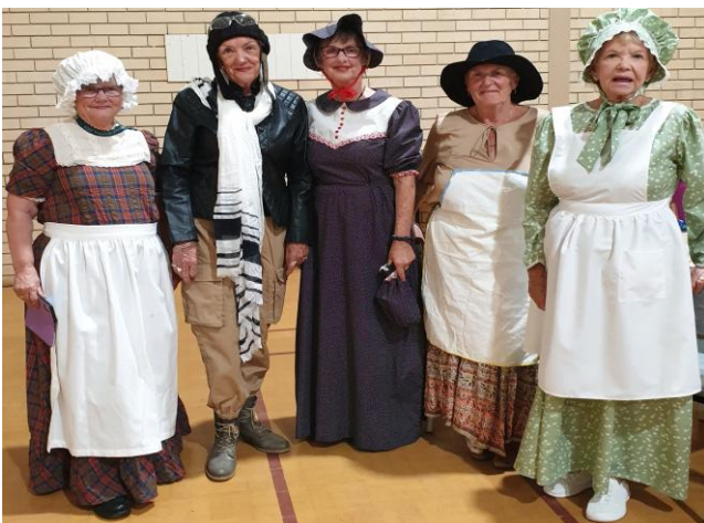
Pioneering days in WA

We look forward to meeting up with many of you, here in the west in August at Leeman.