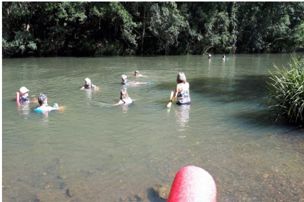
Noodle race practise 🏄 🏄

Our April outing to the Lostock Dam Caravan Park is scheduled for next week, therefore will miss this edition of the newsletter. Keep safe everyone, until we catch up again.