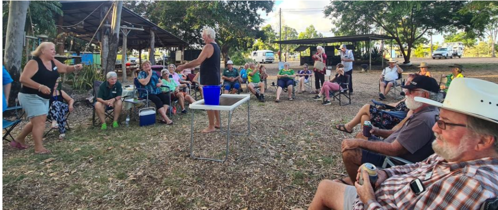
Let the games begin!